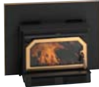
Legacy™ C260 1,200–2,200 sq. ft.*