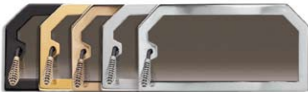
Traditional door—Available on all models Black, 24K gold-plated, brushed gold-plated, nickel-plated, or brushed nickel-plated

Choose the door style and finish that is right for you. The Traditional door is available on all models, while the Arch door is available on the Striker C160 and Performer C210 only. Choose from black, 24K gold-plated, brushed gold-plated, nickel-plated, or brushed nickel-plated (Elite E260 available with gold or nickel finish only).