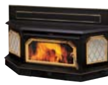
Elite™ E260 1,200–2,200 sq. ft.*