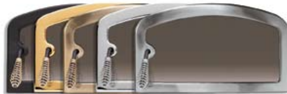
Arch door—Available on C160 and C210 only Black, 24K gold-plated, brushed gold-plated, nickel-plated, or brushed nickel-plated