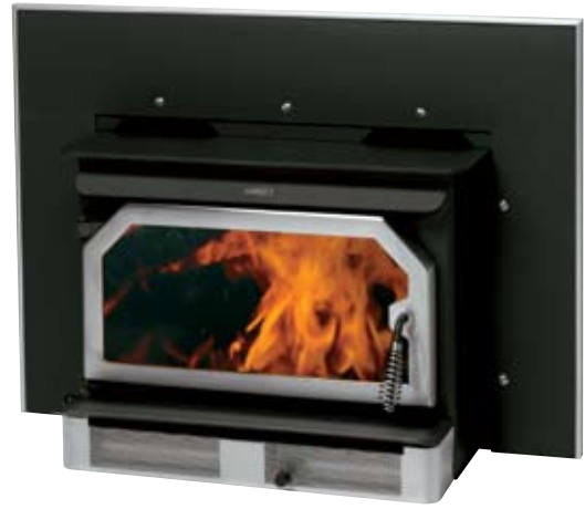
Legacy™ C260 shown with brushed nickel-plated Traditional door and blower, nickel surround trim and nickel-plated surround screws.