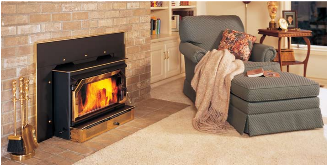
Legacy C260 shown with 24K gold-plated Traditional door, 24K gold-plated blower, 24K gold-plated surround trim and gold-plated surround screws.