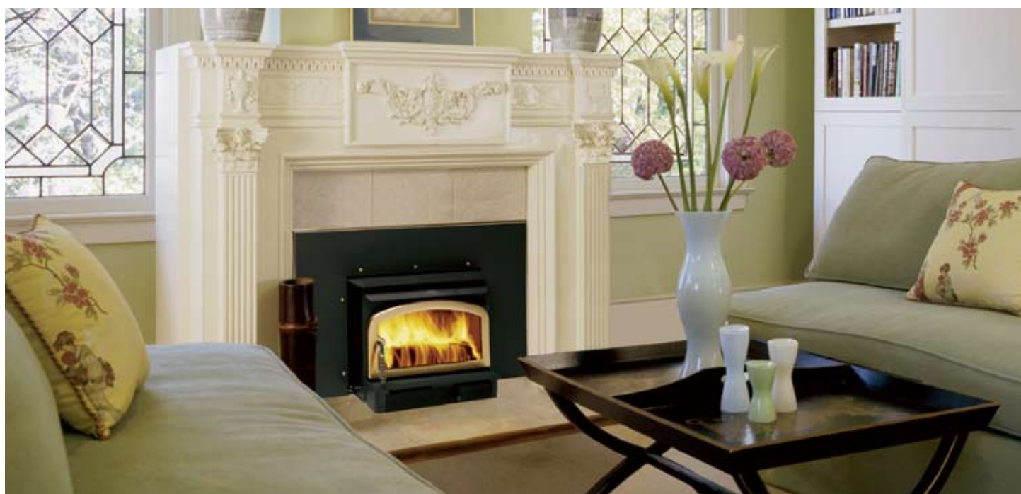
Striker CA160 shown with gold-plated Arch door, gold-plated surround trim and gold-plated surround screws.