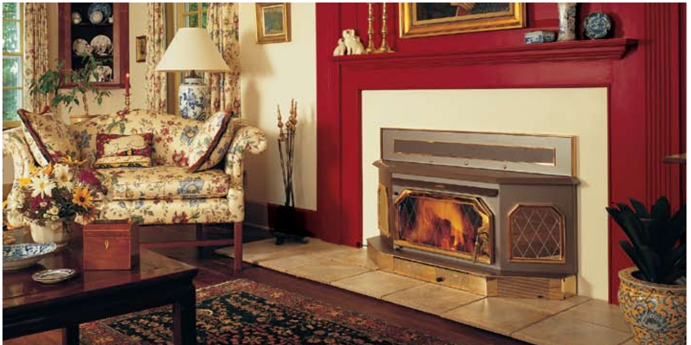
Elite E260 shown with custom metallic brown paint with gold-plated Traditional door and side bay mirrors, diamond-etched glass, gold surround trim, gold-plated blower and gold-plated surround screws. (See your local dealer for custom paint colors.)

"I grew up with a Country wood stove and today I keep my family warm with a Country... Thank you!"