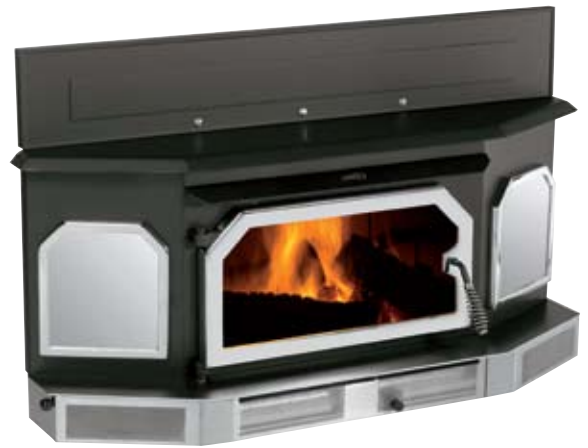
Elite™ E260 shown with nickel-plated Traditional door and side mirror frames, plain glass, nickel-plated blower, black surround trim and nickel-plated surround screws.