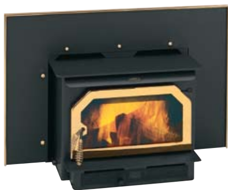
Performer™ C210 shown with gold-plated Traditional door, black blower, gold surround trim and gold-plated surround screws.