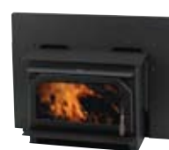
Canyon™ C310 1,600–3,000 sq. ft.*