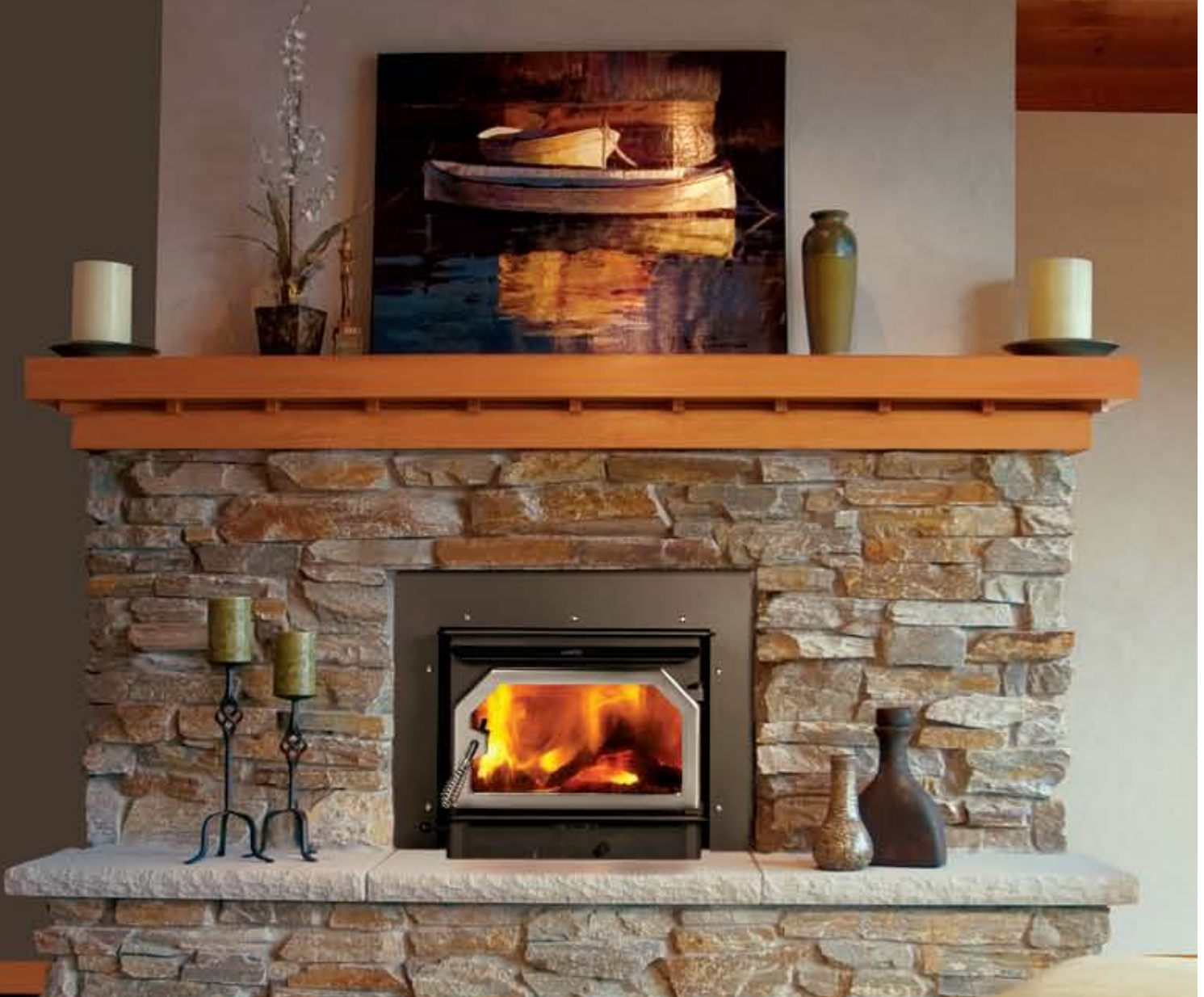
Striker™ C160 shown with optional brushed nickel-plated Traditional door, nickel-plated surround screws, and black variable-speed blower.

■ The Country™ Collection line of wood-burning inserts offers a complete selection of products to meet your heating needs. Available with an array of door styles and finishes, surrounds, and powerful heat-circulating blowers, Country Collection inserts can be customized to suit your individual needs and tastes. In addition to a variety of options, every wood-burning insert that leaves our plant is built with premium-grade materials and the utmost commitment to quality. We incorporate innovative technology and designs to make Country Collection wood-burning inserts among the most beautiful, efficient, reliable, and environmentally friendly products on the market today. ■