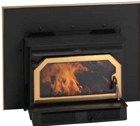
Canyon™ C310 shown with 24K gold-plated Traditional door, black blower and gold surround trim.