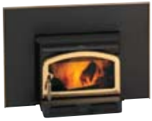
Striker™ C160 600–1,300 sq. ft.*

Choose the unit that best fits your heating needs.