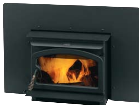
Striker™ CA160 shown with black Arch door.