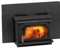
Performer™ C210 1,000–1,800 sq. ft.*